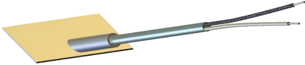
Plate type thermocouple with cable connection